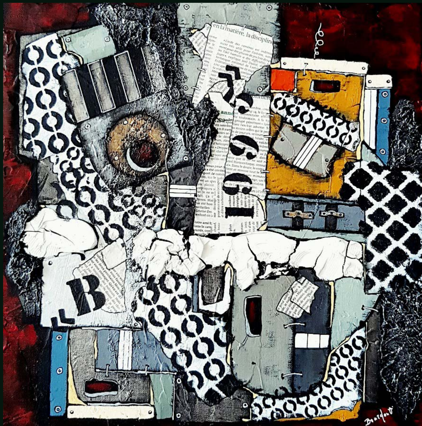
2017 - Sans Titre N°91, Acrylique, Technique Mixte (pâte de structure) sur Toile 40x40 cm 2017 - Untitled N°91, Acrylic, Mixed Media (dough structure) on canvas 15,75x15,75 inches