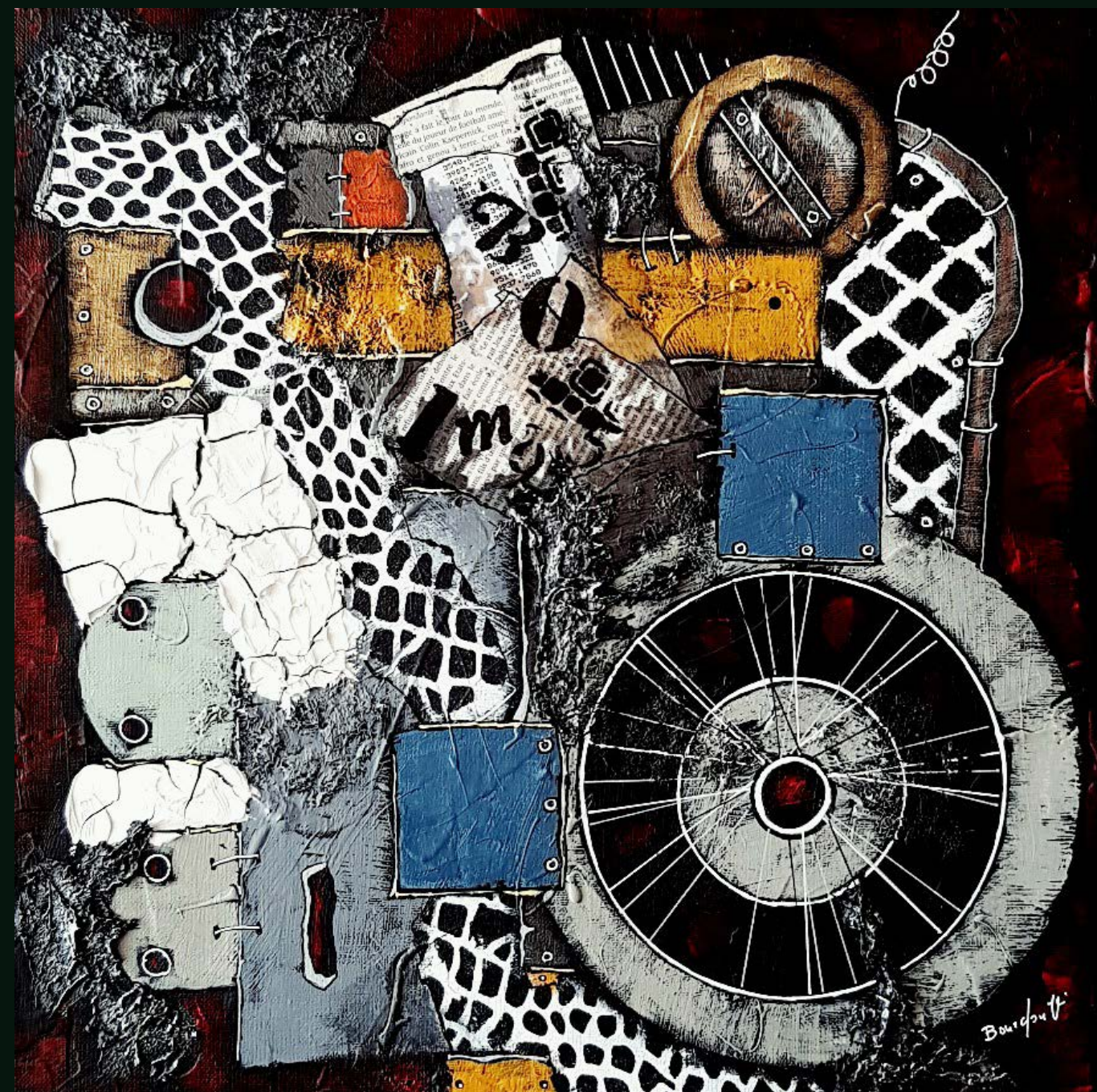
2017 - Sans Titre N°92, Acrylique, Technique Mixte (pâte de structure) sur Toile 40x40 cm 2017 - Untitled N°92, Acrylic, Mixed Media (dough structure) on canvas 15,75x15,75 inches