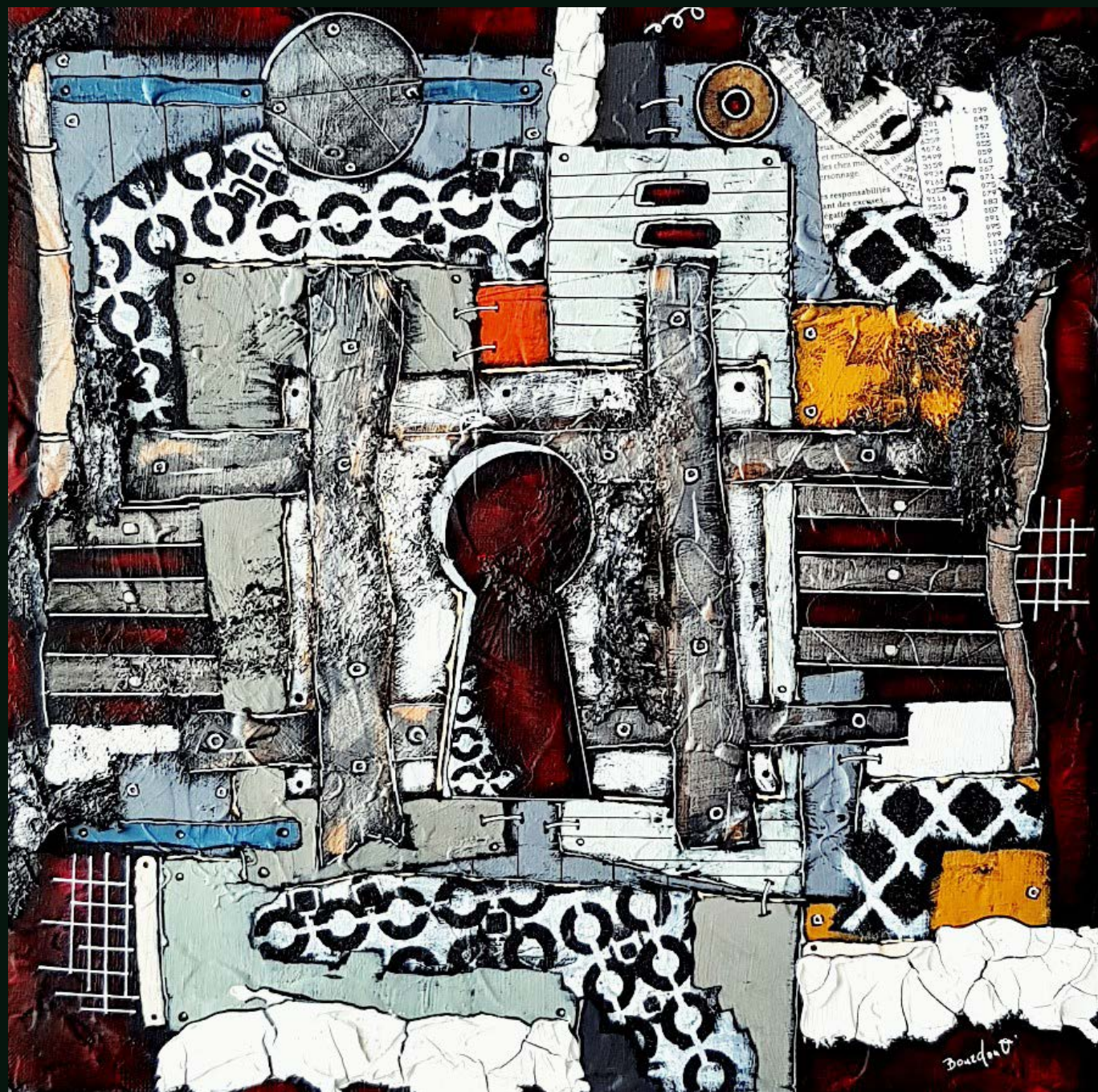
2017 - Sans Titre N°93, Acrylique, Technique Mixte (pâte de structure) sur Toile 40x40 cm 2017 - Untitled N°93, Acrylic, Mixed Media (dough structure) on canvas 15,75x15,75 inches