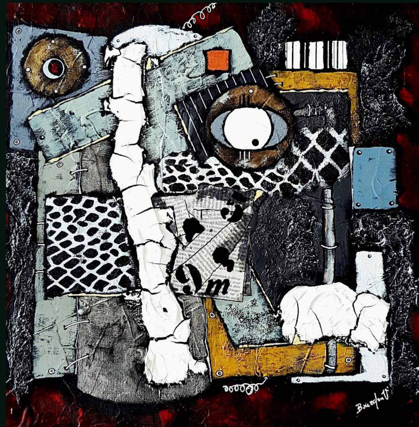
2017 - Sans Titre N°90, Acrylique, Technique Mixte (pâte de structure) sur Toile 40x40 cm 2017 - Untitled N°90, Acrylic, Mixed Media (dough structure) on canvas 15,75x15,75 inches