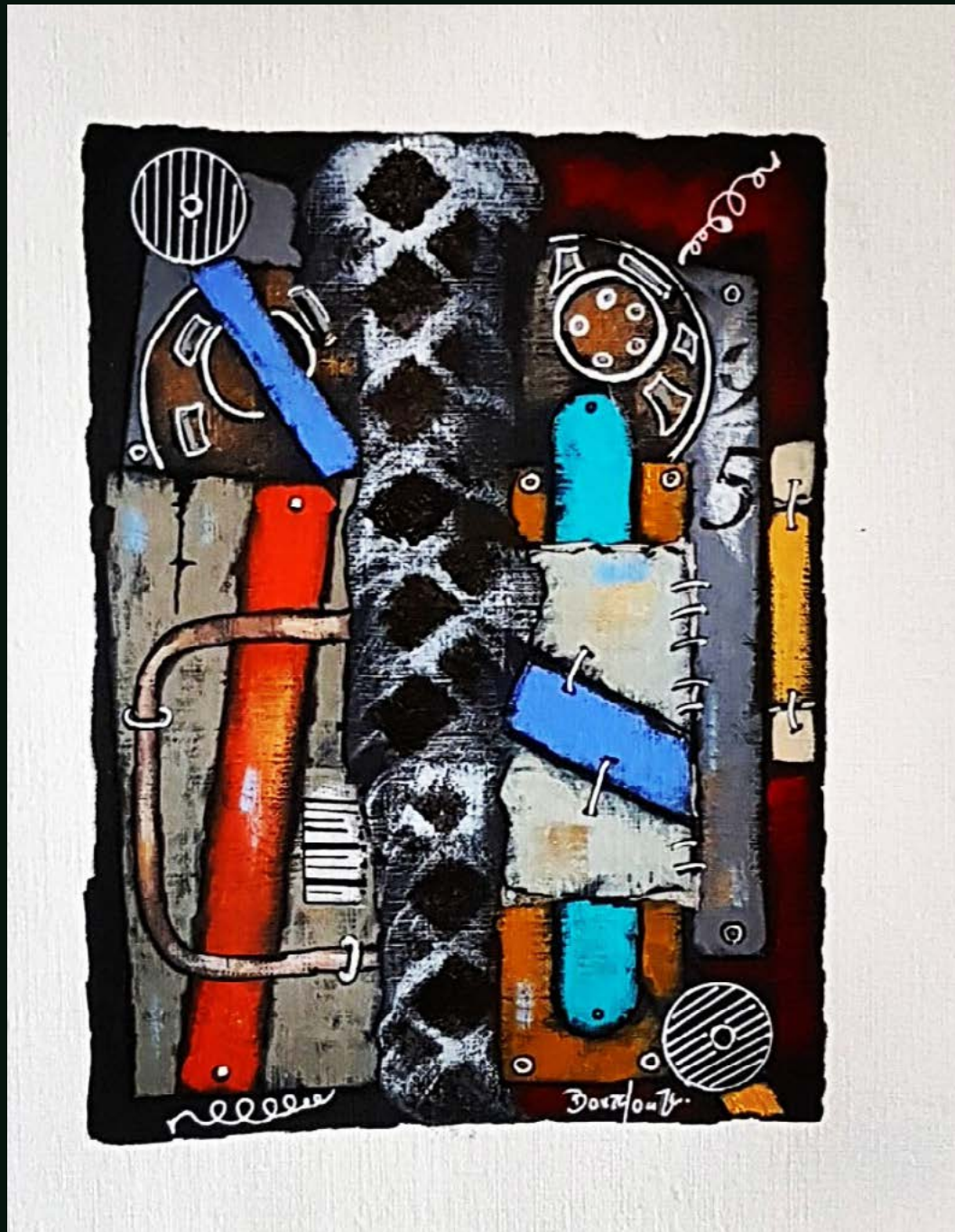
Dessin 2017 - Sans Titre N°13, Acrylique, sur papier 17x23 cm Drawing 2017 - Untitled N°13, Acrylic, on paper 6,69x9,05 inches